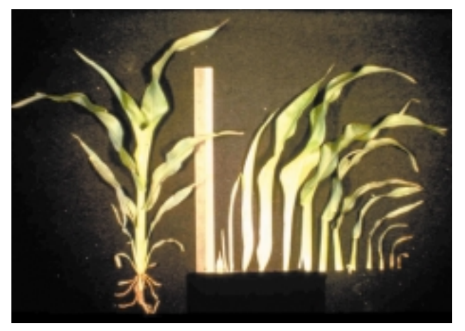
Figure 3. The appearance of grain sorghum at the panicle initiation growth stage.

The flag leaf is the last leaf to emerge from the whorl. It is smaller than the other leaves and positioned directly below the panicle. When the flag leaf collar appears, the plant is in the boot stage (Figure 4). The sorghum panicle development is complete and primed for flowering, and the plant has attained its maximum leaf area and accumulated approximately 60 percent of its total dry matter. Severe drought stress at this time can impede panicle exertion from the boot and lead to incomplete flowering (anthesis), seed set and loss in grain yield. The crop's water requirements are greatest