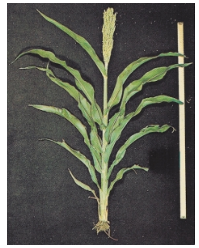
Figure 6. Grain sorghum head at the beginning of the flowering stage.

Environmental stress from heat or drought does not usually affect pollination, but herbicide drift prior to, during or immediately following pollination can interfere with seed set and severely reduce yield. The sorghum midge, a common insect pest in central and south Texas, is damaging at this stage,