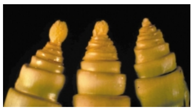
Figure 2. The growing point of sorghum following panicle initiation. Far right: A growing point one day after panicle initiation with raised bumps developing into primary panicle branches. Center and left: Growing points 5 and 7 days after panicle initiation containing secondary and tertiary primordial branches.

If sorghum is being grown under irrigation, it is important that the crop not be allowed to stress at the beginning of this stage when the potential number of seed per plant is being set. Following panicle initiation, the plant abruptly stops forming new leaves and begins to form the plant's reproductive structures. Although panicle initiation marks the moment when the plant attains its max-