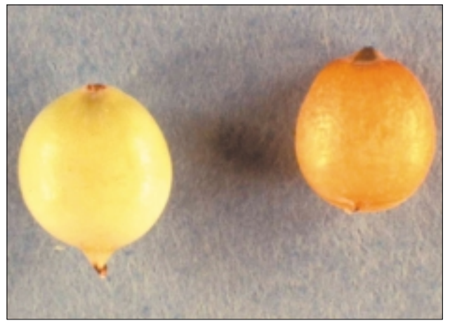
Figure 7. A physiologically mature sorghum kernel at 35 percent moisture with recently formed black-layer (left), compared to a sorghum kernel at 13 percent moisture from panicle ready for mechanical harvest.

Kernel size and weight varies in sorghum, typically ranging from 2.0 to 4.5 millimeters in diameter (Figure 8). On average, kernels weigh about 25 grams per 1,000 seed (18,000 seed per pound) but can range from 13 to 40 grams per 1,000 seed (e.g., 11,300 to 33,600 seed per pound). Kernel size and weight depend on the plant's ability to accumulate dry matter during GS III. Weather, soil fertility and available soil water influence final size and weight of kernels. Eighty-five percent of the dry matter produced by the plant during GS III goes directly to grain. Only 15 percent of final grain weight originates from dry matter produced during GS I and GS II. Hybrids with high seed numbers typically have low seed weights (e.g., high numbers of seed per pound) and vice-versa. An early freeze or severe