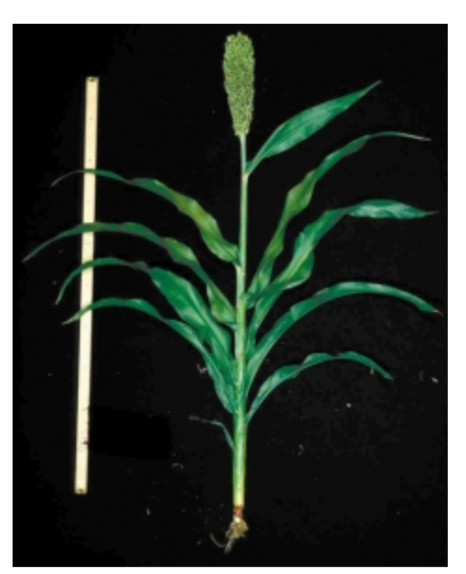
Figure 5. Grain sorghum at the heading stage.