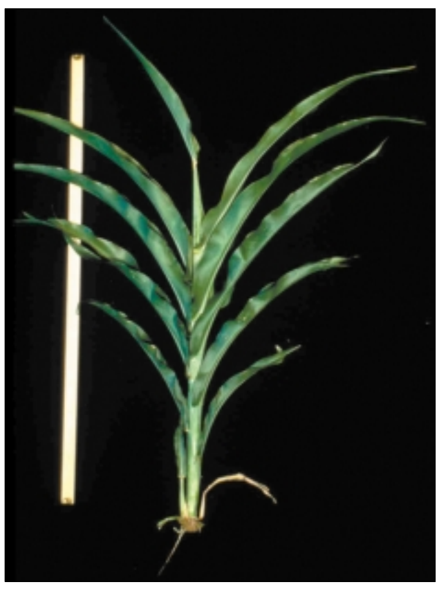
Figure 4. Grain sorghum plant at the boot stage.

The development of the panicle, its floral structures and the remaining leaf area is extremely sensitive to drought and stresses caused by greenbugs, corn leaf aphids and chinch bugs. Stress reduces the number of florets and, ultimately, the number of seed in the panicle for grain formation. Furthermore, applications of 2,4-D- or dicambacontaining products after panicle initiation can injure and reduce seed number and yield. Cultivation should be avoided after panicle initia-